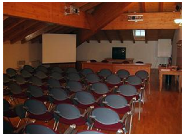
Aerial view of Pieve Tesino (left) and classroom of the Alpine Studies Centre (right)